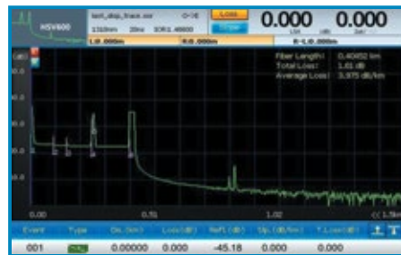
Abstract curve visualization