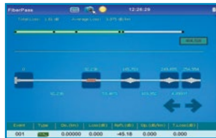
Even dead zone≤0.8m Attenuation dead zone≤4m